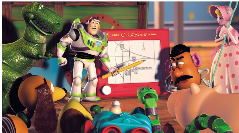
Think about the details that went into this one shot from ‘Toy Story 2 (1999)

Still a bit confused? Take a look this short clip below to see how professional animators use clay to create classics like “Wallace & Gromit” and “Chicken Run”.